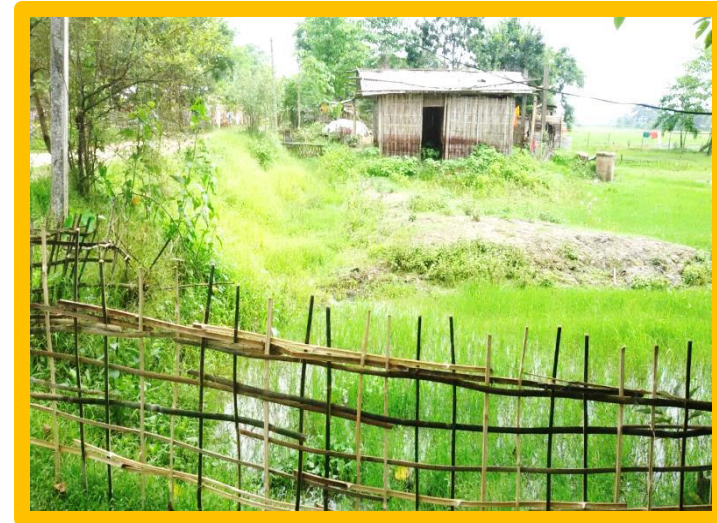
Radhika Nagar, Rudrasagar, Area 10 After cleaning of oil Spill Site