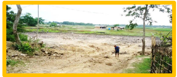
Radhika Nagar, Rudrasagar, Area 1 After Restoration of oil Spill Site