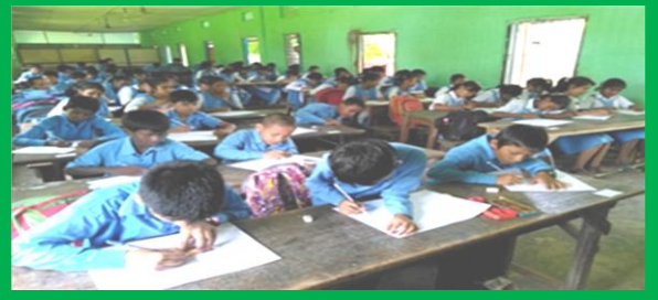
Simoluguri High School