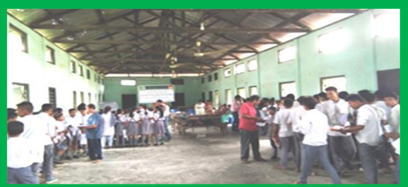
Mazenga H S School