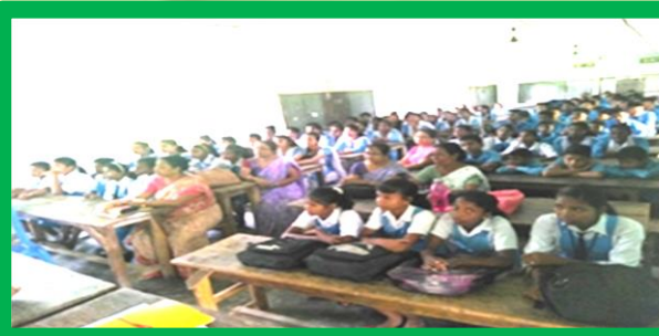
Nazira Girls HS School