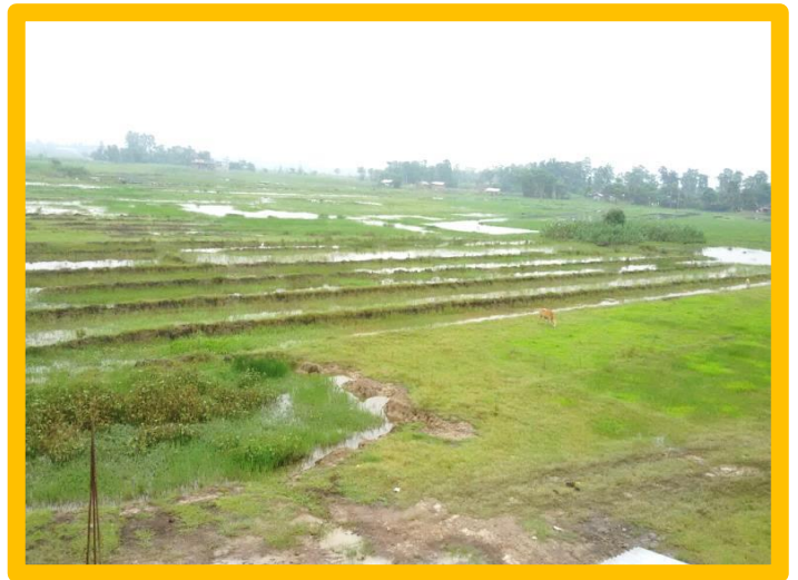
Radhika Nagar, Rudrasagar, Area 8 After Restoration of oil Spill Site