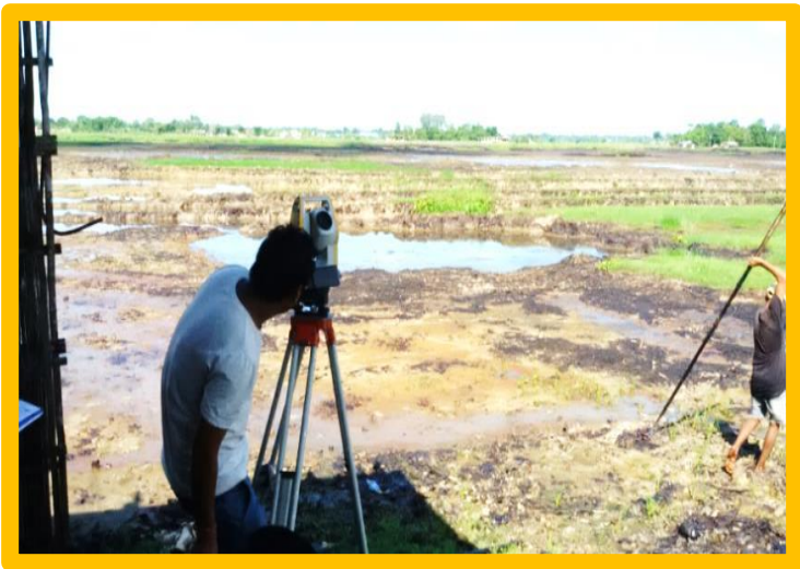
Radhika Nagar, Rudrasagar, Area 8 Before Restoration of oil Spill Site