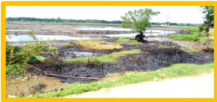
Radhika Nagar, Rudrasagar, Area 4 Before cleaning of oil Spill Site