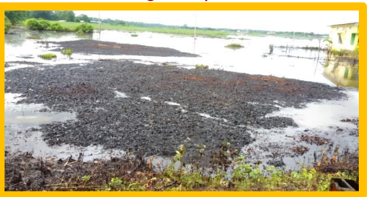
Radhika Nagar, Rudrasagar, Area 7 Before cleaning of oil Spill Site