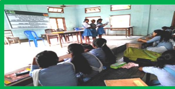
Ligiripukhuri HS School