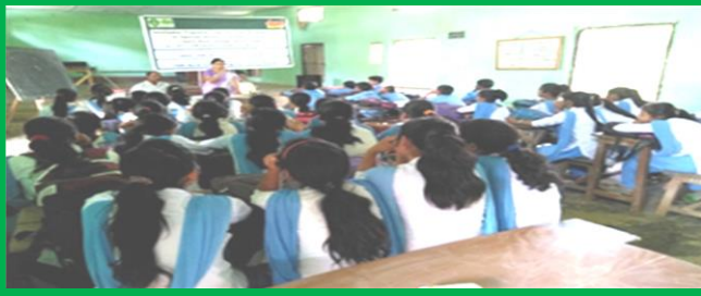
Bortola H.S. School: