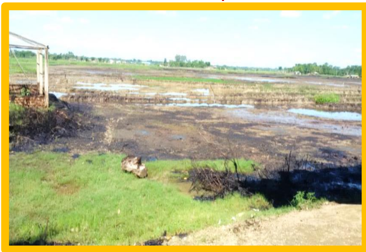
Radhika Nagar, Rudrasagar, Area 9 Before Restoration of oil Spill Site