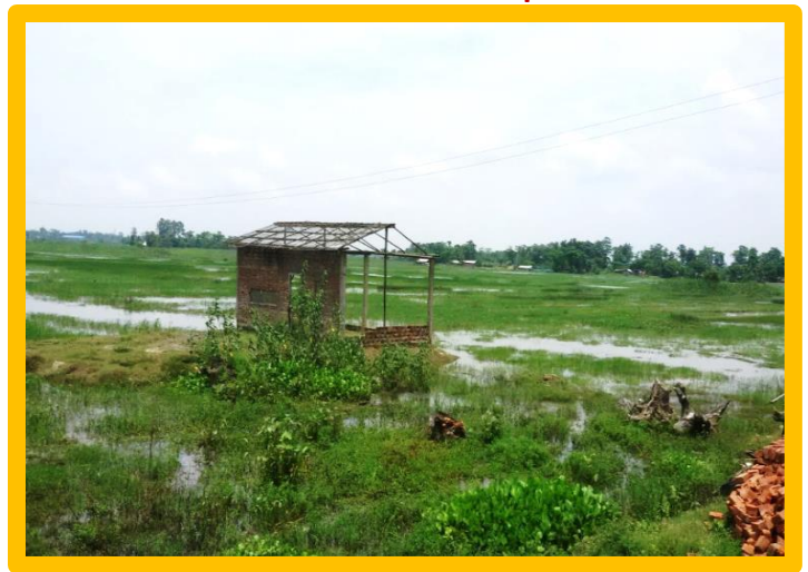
Radhika Nagar, Rudrasagar, Area 9 After Restoration of oil Spill Site