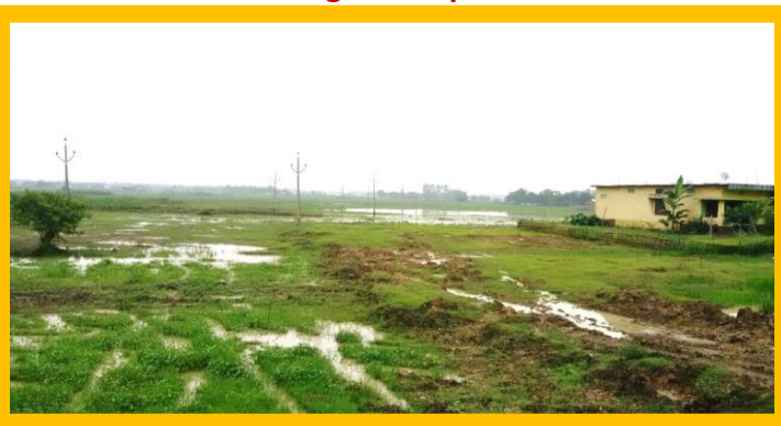
Radhika Nagar, Rudrasagar, Area 7 After cleaning of oil Spill Site