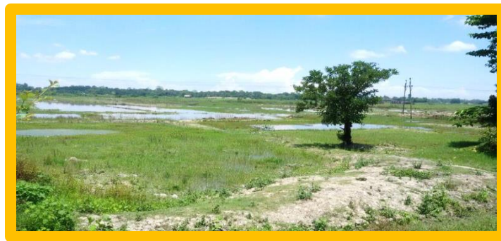
Radhika Nagar, Rudrasagar, Area 4 After cleaning of oil Spill Site