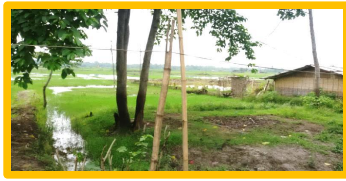
Radhika Nagar, Rudrasagar, Area 6 After cleaning of oil Spill Site