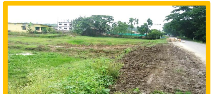
Radhika Nagar, Rudrasagar, Area 2 After Restoration of oil Spill Site