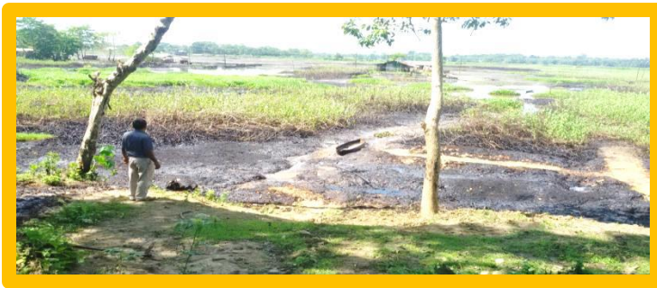
Radhika Nagar, Rudrasagar, Area 1 Before Restoration of oil Spill Site