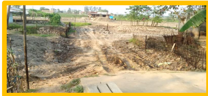
Radhika Nagar, Rudrasagar, Area 5 After cleaning of oil Spill Site