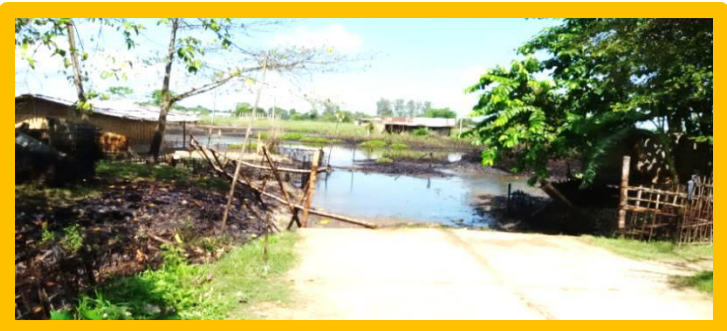
Radhika Nagar, Rudrasagar, Area 5 Before cleaning of oil Spill Site