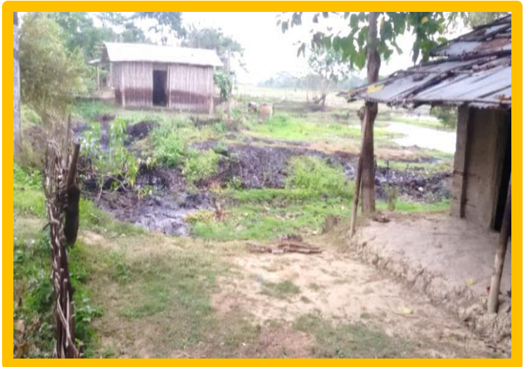
Radhika Nagar, Rudrasagar, Area 10 Before cleaning of oil Spill Site