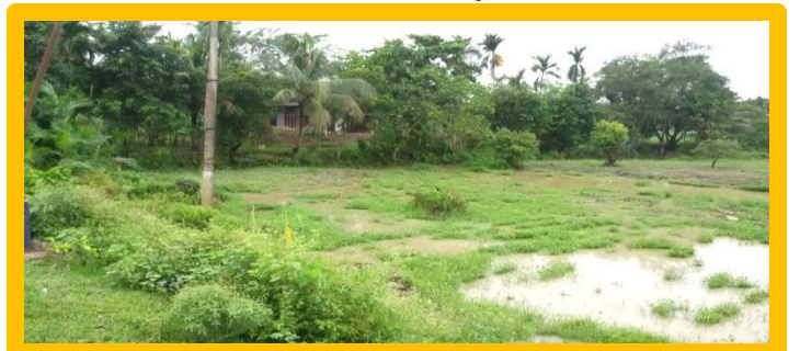
Radhika Nagar, Rudrasagar, Area 3 After Restoration of oil Spill Site