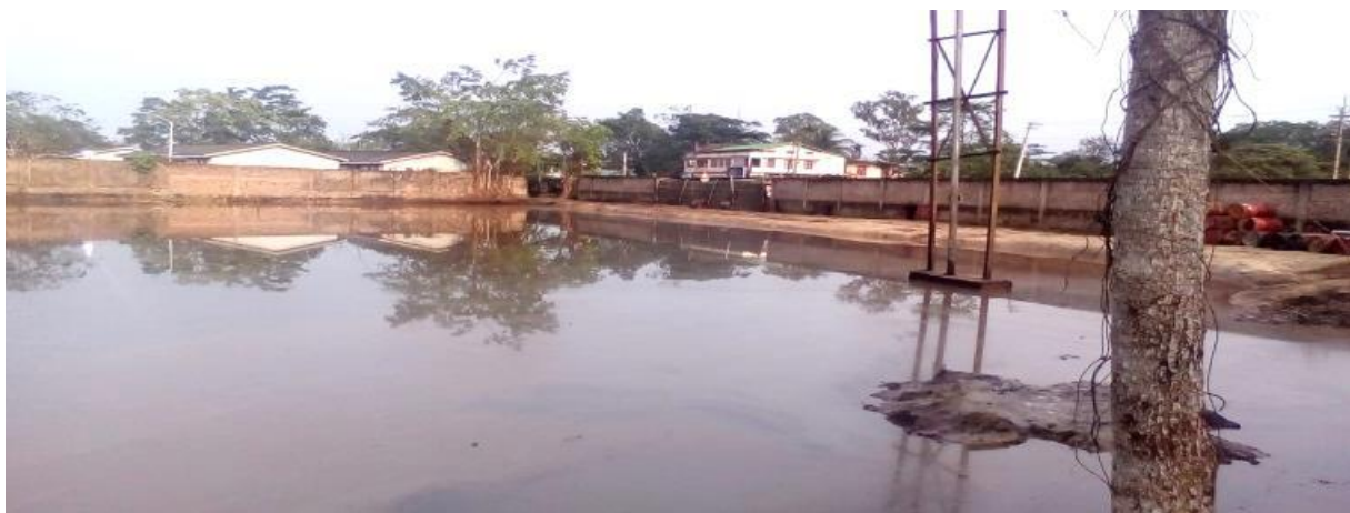
After Completion of clean-up work at oil pipe, line leakage work at 'AB type Colony', ONGC Johrat