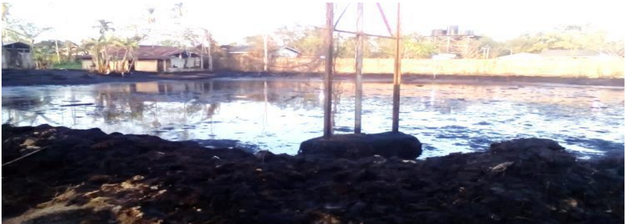
Crude oil pipe, line leakage work at 'AB type Colony', ONGC Johrat

OTBL has got new project from ONGC Johrat 'Line Leakage in AB type Colony', this project has recently Completed.