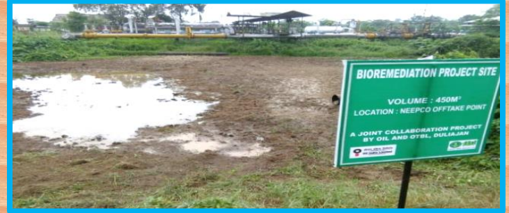
Pit after Application of OILZAPPER (Zero day)