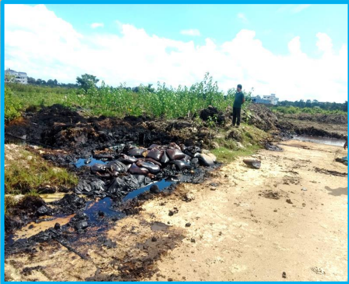
Before Application of OILZAPPER (Zero day)

Bio-remediation of OILY Sludge - 6000 MT; 1 st Application of OILZAPPER completed on 01.11.2018