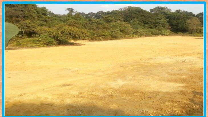
Pit before Application of OILZAPPER (Zero day)