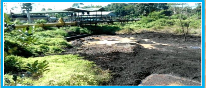
Pit before Application of OILZAPPER (Zero day)