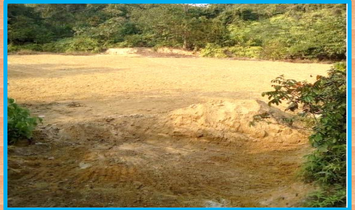
Pit after 3 rd Application of OILZAPPER