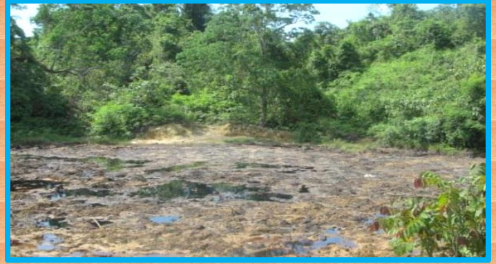
Pit before Application of OILZAPPER (Zero day)