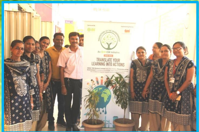
Juna Bet Bhatha Primary School