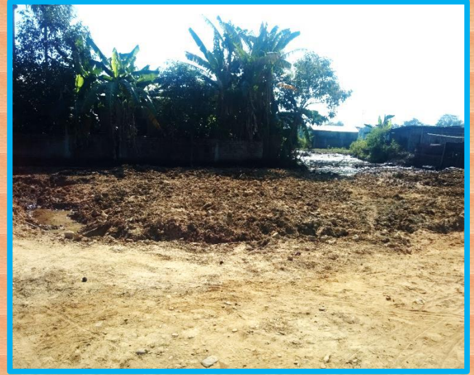
Before Application of OILZAPPER (Zero day)