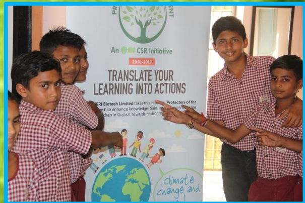
Sudi Primary School