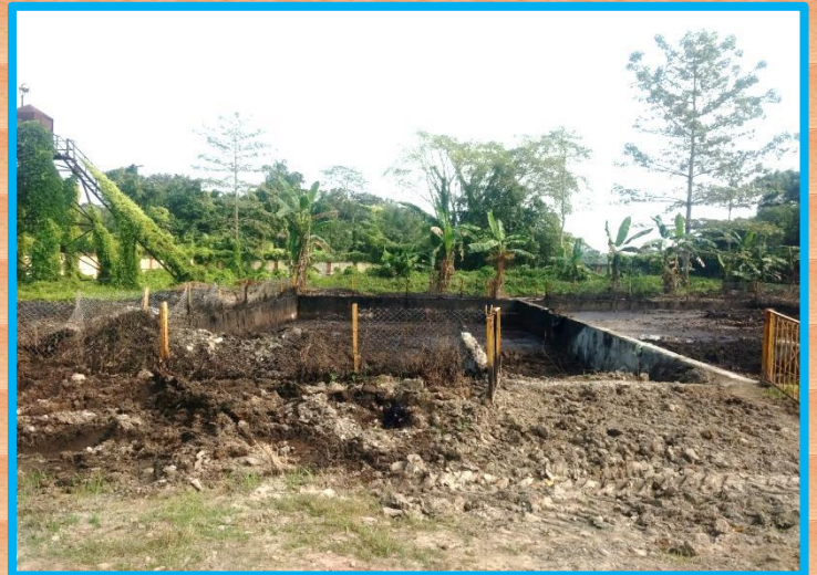
After 1 st Application of OILZAPPER

Photograph of SOBM (Pit) Project Under GGS-III,RDS-Drilling Service-Nazira Asset, Assam