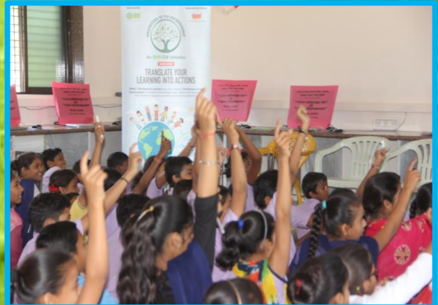
Dabhad Primary School