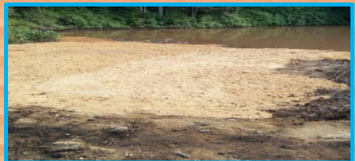
Pit after 3 rd Application of OILZAPPER