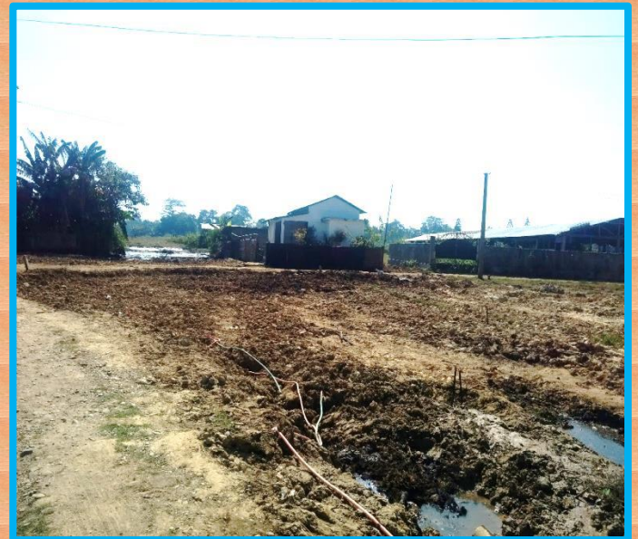
Before Application of OILZAPPER (Zero day)