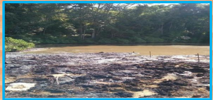
Pit before Application of OILZAPPER (Zero day)