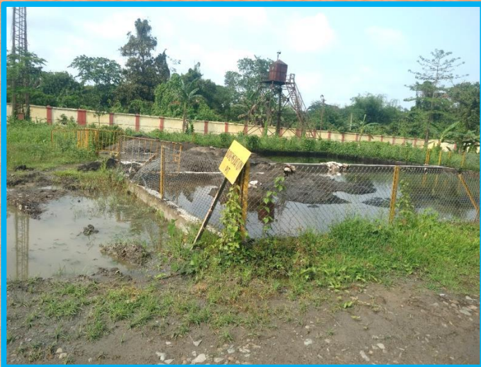
Before Application of OILZAPPER (Zero day)

Bioremediation of OILY Sludge- 496.8 MT; 1 st Application of OILZAPPER completed on 06.11.2018