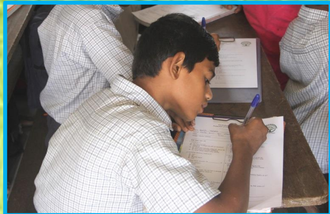
Juna Bet Bhatha Primary School