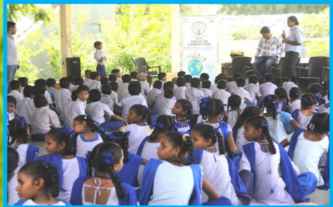
Bhadbhut Primary School