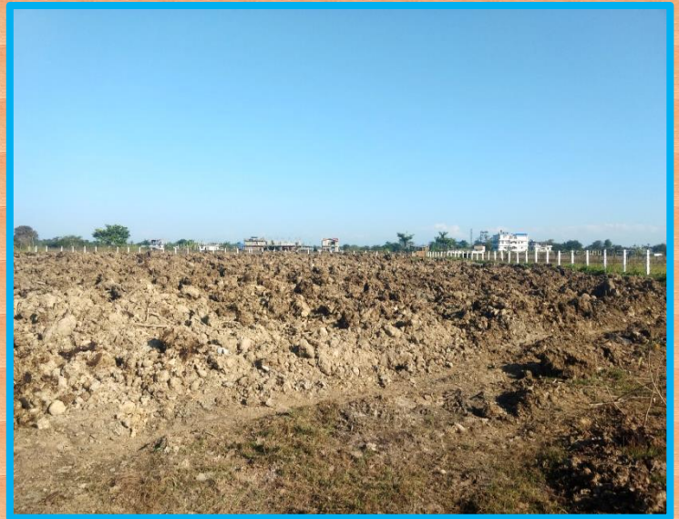
After 1 st Application of OILZAPPER

Photograph of R #181, RDS, GGS-II under Nazira Asset, Assam